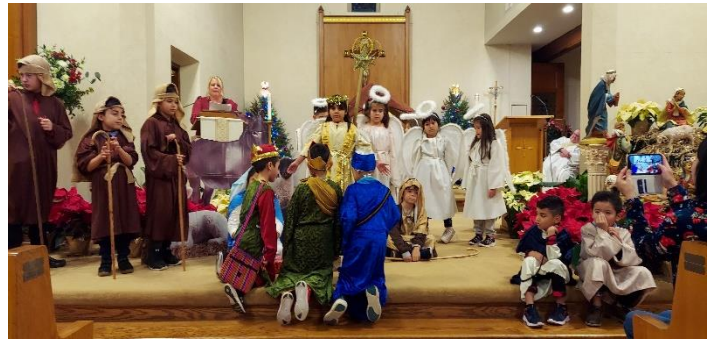
First Communion Class Nativity Play On Christmas Eve

Thank you for adjusting your schedule to be sure your child is at Mass on those four Sundays.